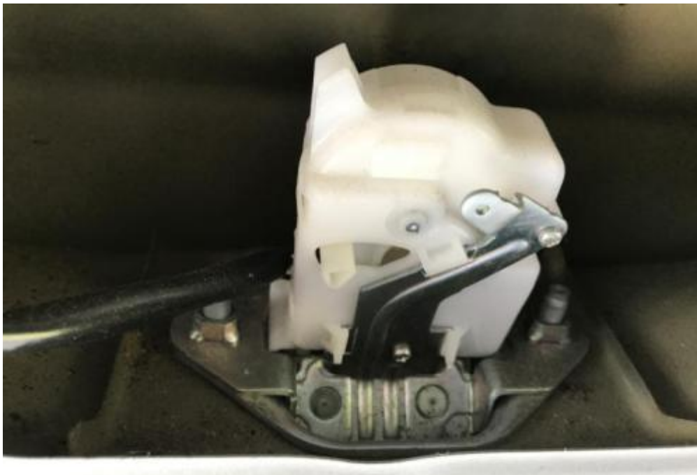
bonus hatch latch picture. when actuating the hatch release, that while plastic lever moved to the right towards the metal arm.