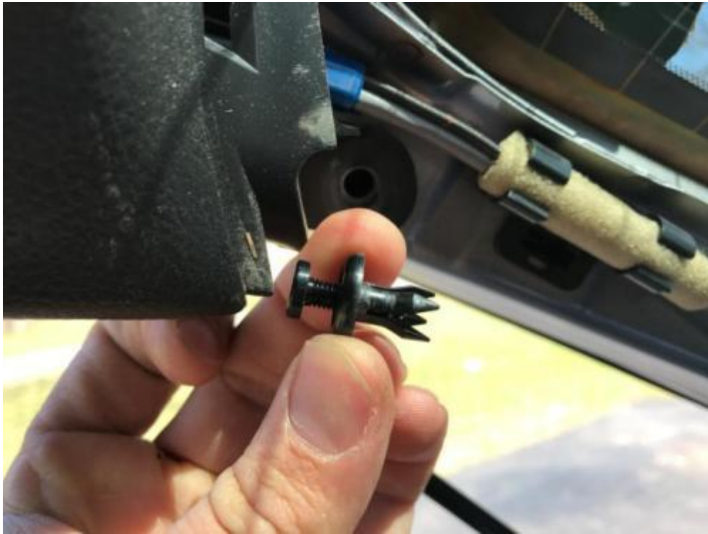
Detail of plastic screw type connector