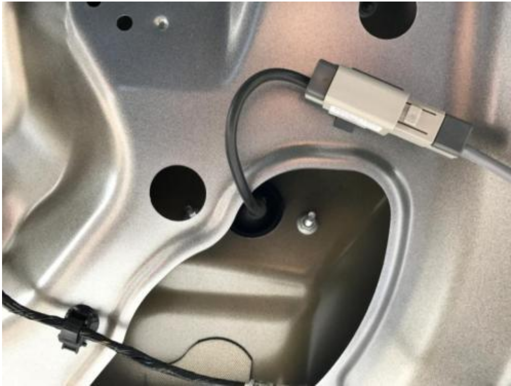
Detail of interior side of reverse camera. Gray connector and two nuts need to be removed, but that is the last step