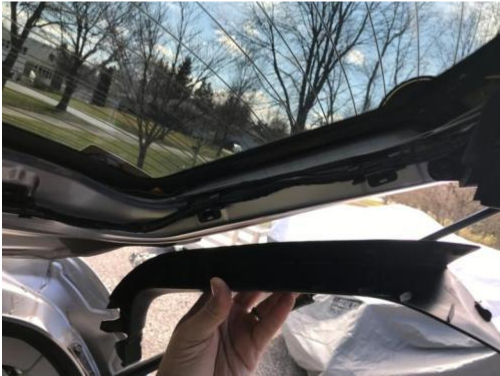
passenger side,side trim