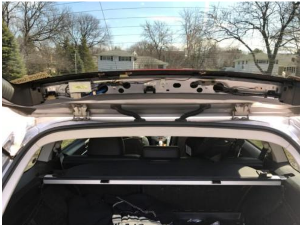
Top interior trim removed