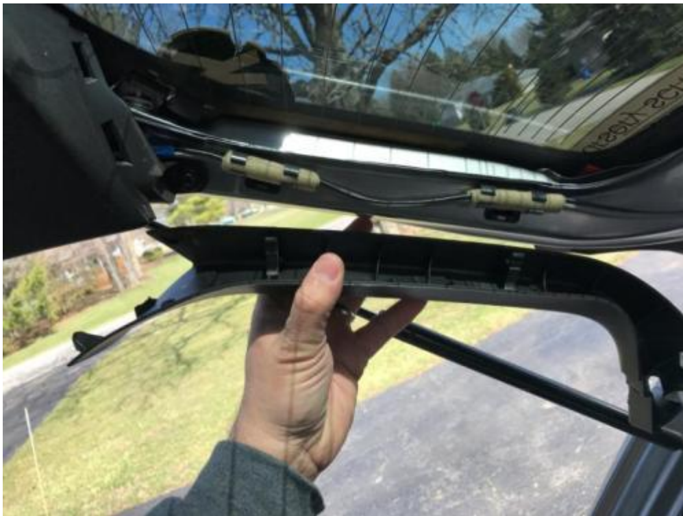
Driver side, side trim.