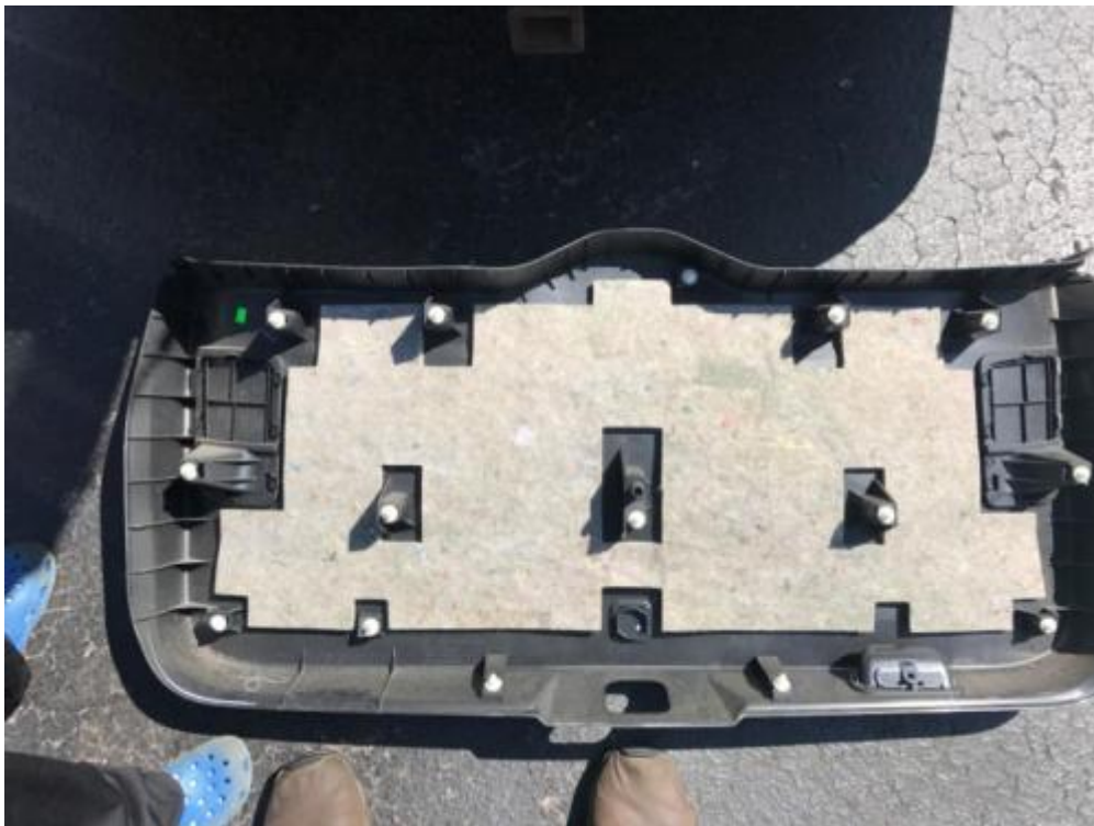
Interior main door panel detail