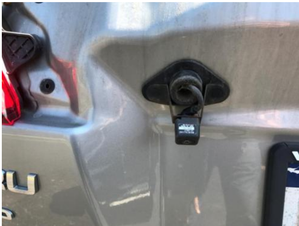
Old cam still mounted