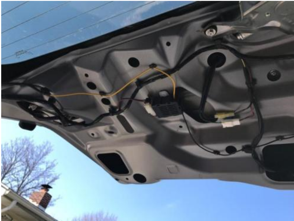
Passenger side interior of lift gate