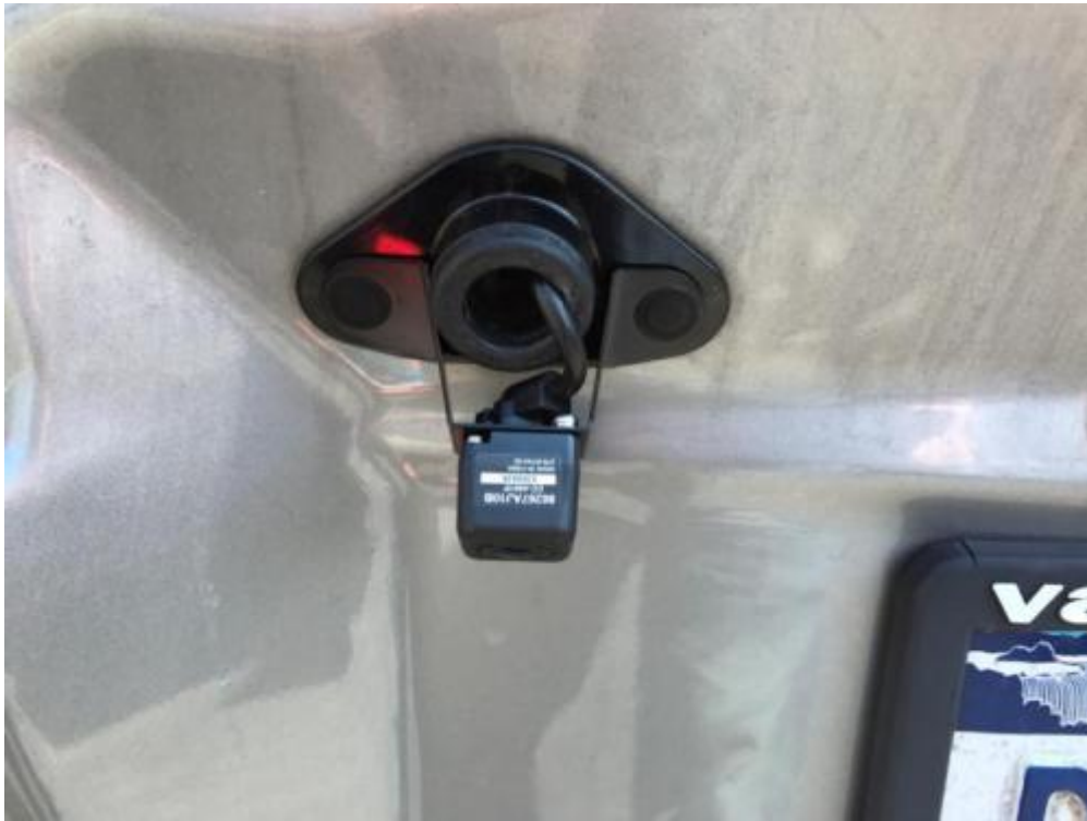
new cam installed