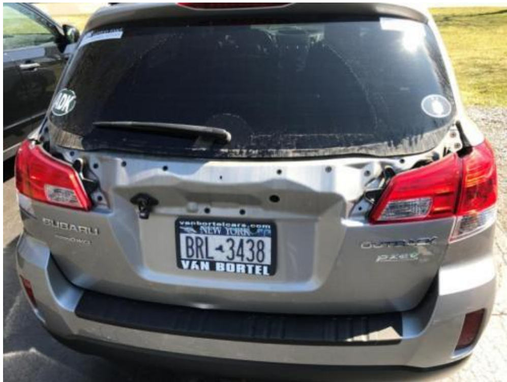
Car with trim piece removed, exposing the camera for replacement