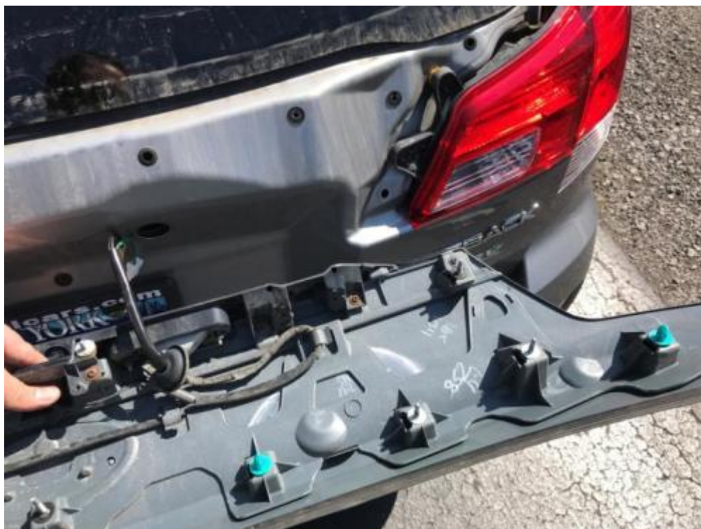
Exterior trim detail, passenger side

5/16" deep socket needed, 8 mm also works, but there are some bolts that need the deep socket. Sheet behind the sockets is the FSM with bolt removal details. 14 nuts to be removed. some nuts on inner skin of hatch aren't removed, but most are,