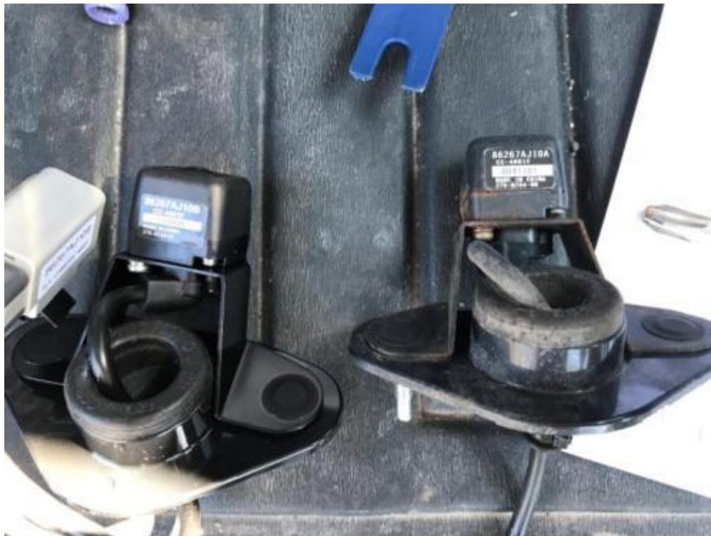
New cam on left, old cam on right. Different part numbers, but same part