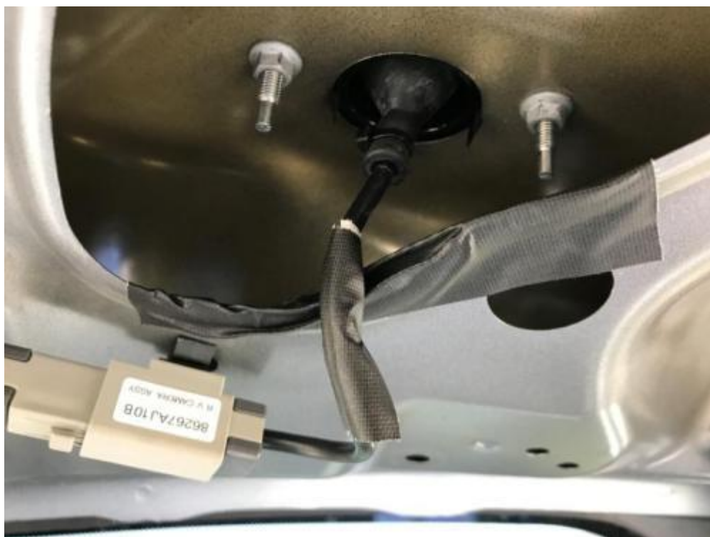
I armored the cable and the edge of the hatch penetration with come tape, seemed sharp to have a cord pressing against it.