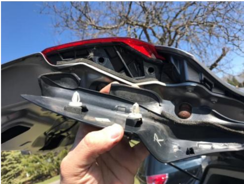
Liftgate side trim, one on each side