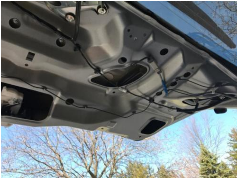
Driver side interior lift gate