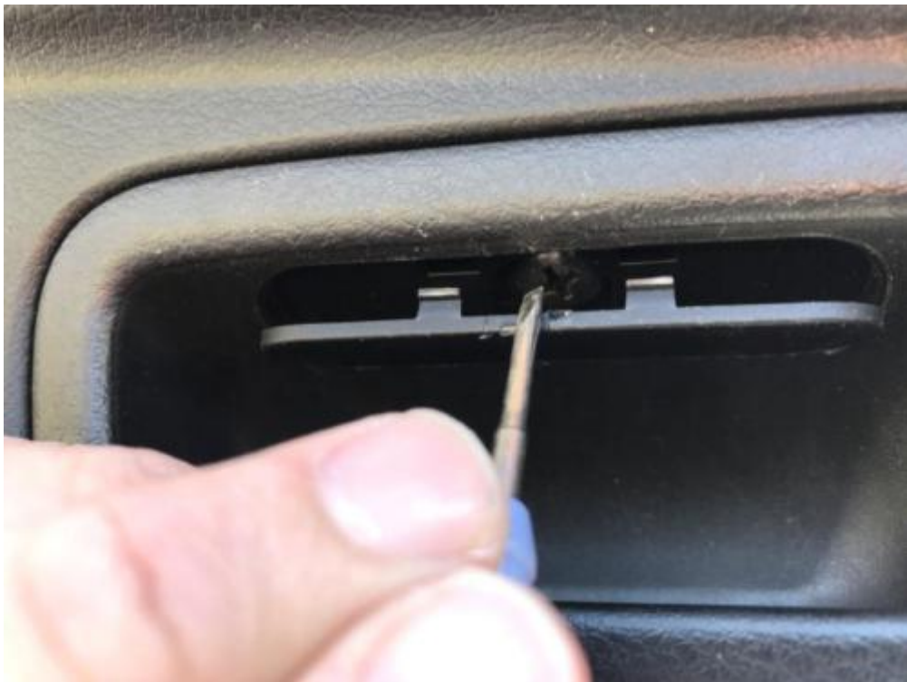
removing cover inside door grab handle