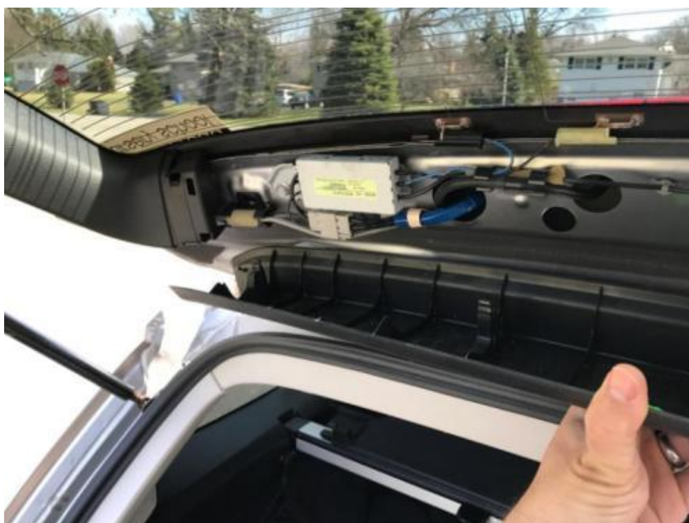
Detail of driver side of top interior trim