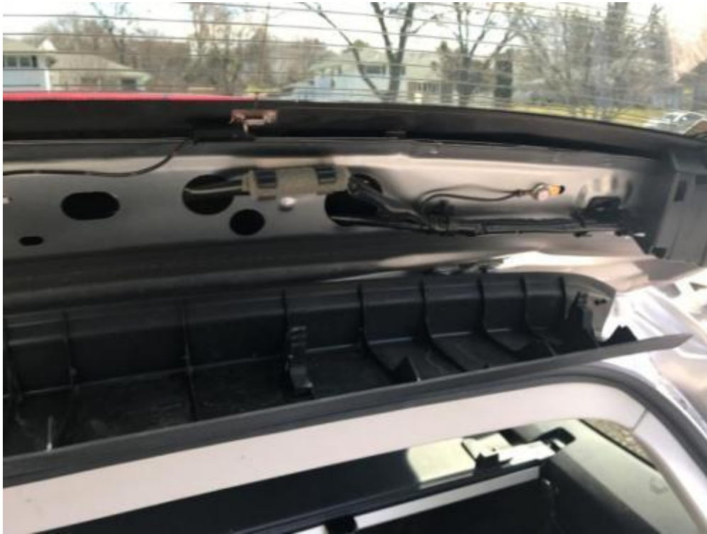
Detail of passenger side of top interior trim