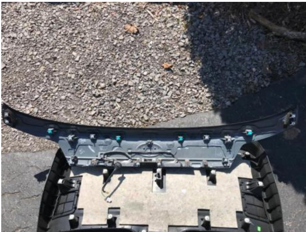
Detail of exterior trim piece

Exterior trim detail, driver side. When removing the trim piece, look down from the top and find the press fit connectors, hold them to the trim piece with your hand and pull. if you just yank the trim piece off you may break it, as the trim assembly is 2 pieces, and the inner piece without the connectors is foam taped to the outer finish piece