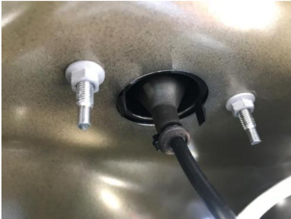
detail of camera mounting interior